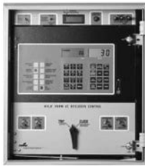
Figure 1. Kyle ® Type Form 4C Recloser Control