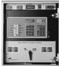
Figure 1. Kyle® Type Form 4C Recloser Control

Reclosers Kyle® Form 4C Recloser Control Front Panel Replacement Kit KME4-701 Installation Instructions COOPER Power Systems Service Information S280-77-13